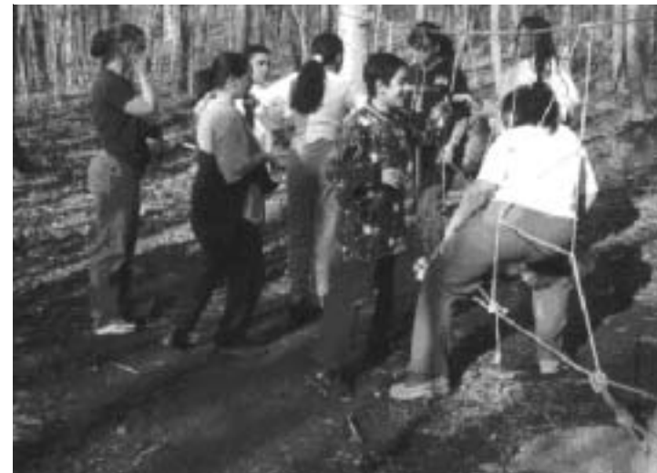
Finding a way through the spider's web teaches kids if they work together they can find a way. Woodrock's mission is to promote interracial, interethnic and intercultural harmony among youth.

Those surveyed cited these impacts of nonprofits: