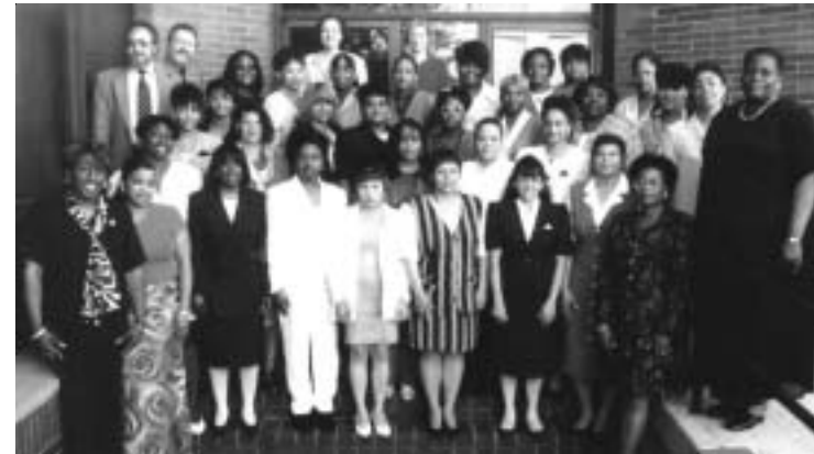
One of Campus Boulevard Corporations' (CBC) recent graduation classes with staff. CBC has directed a wide range of programs in its neighborhoods- from youth projects to safety and security programs. In 1994, CBC embarked on targeted economic development activities, including a small business Incubator and Job-Training programs for low and moderate income residents.

Rather than a longitudinal study, this is a “snapshot” of Pennsylvania’s nonprofit sector, so we cannot measure- nor speak to-trends. We heard from those employed by the nonprofit sector, both in their written survey responses, and what they said in focus groups held on both ends of the Commonwealth. We saw people and organizations working through the ramifications of government devolutions, and we saw the greater role that the for-profit sector is beginning to play in the provision of services historically performed by either government agencies or nonprofits.